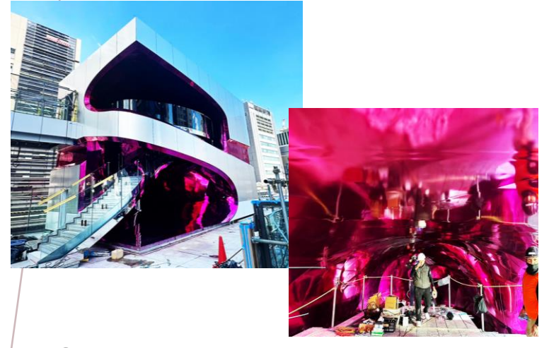
Shibuya development project with Tokyu Corp