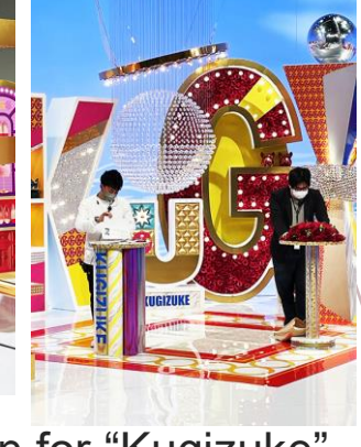
Studio decolation for "Kugizuke" of Yomiuri TV