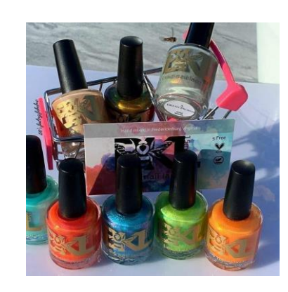
Nail colors sold in the USA