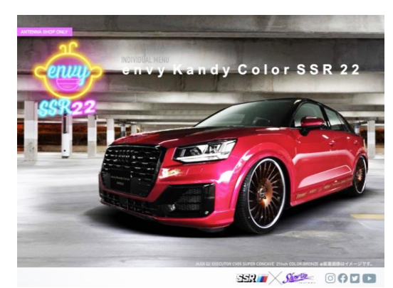
SHOW UP color on SSR wheels