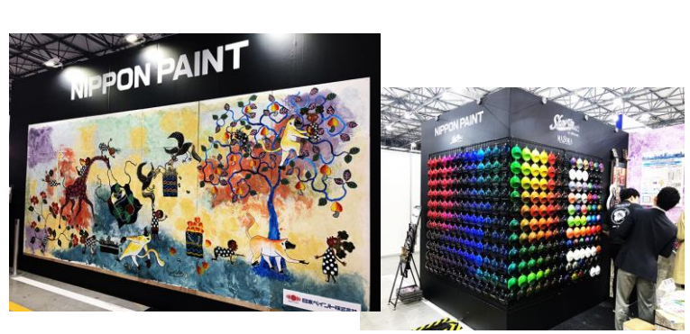
Architecture convention with Nippon Paint